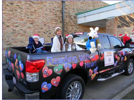
The Friends of the Library at the Richardson Christmas Parade