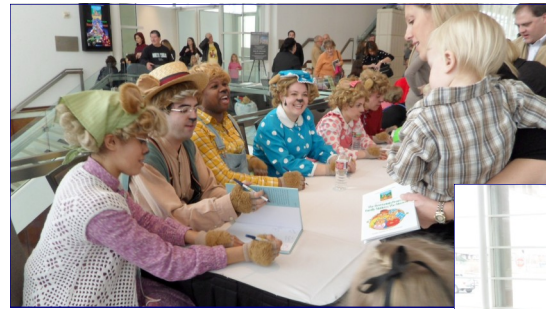
Family Theater Series Berenstain Bears performance on January 23